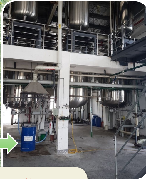
Extraction and boiling machinery used for the fermentation and extraction process of Levo ® SL from the seeds of S. flavescens